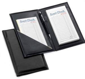
Server Book Holder

18" - $5.16 24" - $5.76 36" - $7.02 48" - $8.74