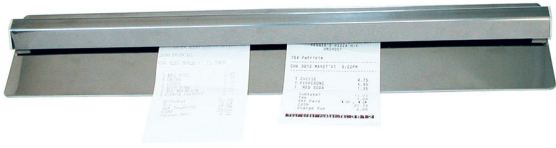
Ticket Holder Order Racks

18" - $5.16 24" - $5.76 36" - $7.02 48" - $8.74