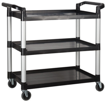
40 3 / 4 Lx19 1 / 2 W $85ea