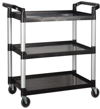
32"Lx16 1 / 8 "W $65ea